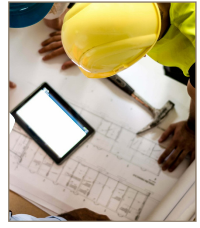
Contractor Pool Construction Services